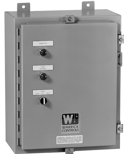
Single-function standard panel